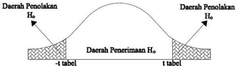
Image of Distribution of Partial Acceptance or Rejection of Hypothesis

If b_j = regression coefficient of variable X, compare the results of t count and t table, The t test in this research was carried out with the help of the SPSS software program.