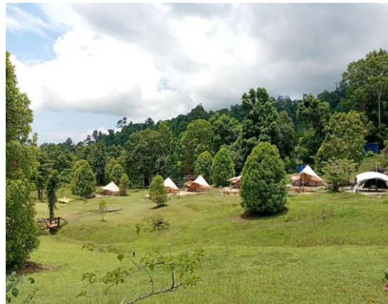
Figure 4. Natural View of the Waai Tree House.

management family members can improve the quality of service without taking away the personal warmth that is a unique characteristic of this destination.