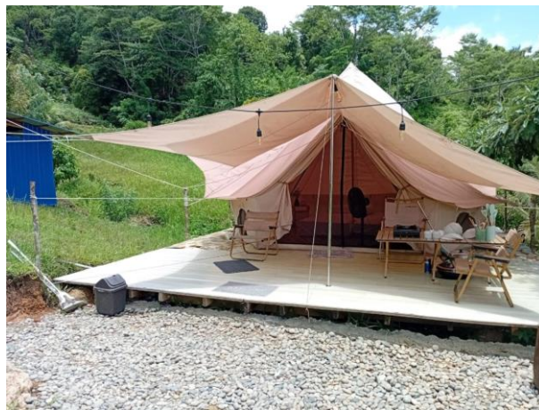
Figure 3. Waai Tree House Glamping Facilities.

The development of more creative and aesthetic photo spots by utilizing existing natural elements such as large trees, cliffs, and ocean views can create Instagram-worthy moments that encourage tourists to share their experiences organically on social media. The addition of educational rides such as endemic plant conservation areas, interactive treehouses , and nature trails with educational information boards can increase educational value while maintaining the visual appeal of the destination.